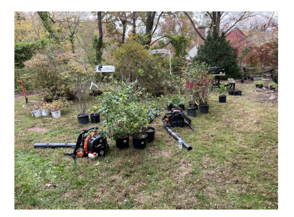
Installation of new planting in the family garden — Fall, 2002